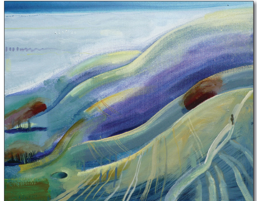
Below right: Blue Downs (oil) Kate Penoyre